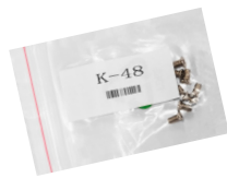
K-48 screw kit