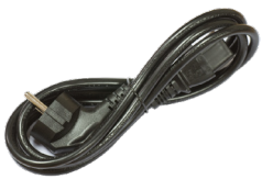
2 IEC cords